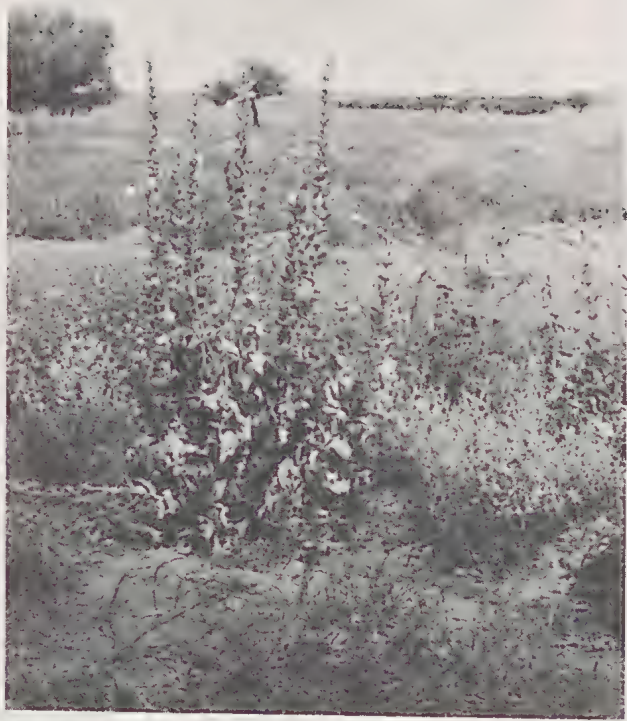
Fig. 1. Mature plant at Dalhousie Springs.